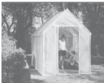
Plastic clamps can be used to construct greenhouses or screened-in shelters for your back yard.

Contact: FARM SHOW Followup, Circo Innovations, 14910 Meadow Dr., Grass Valley, Calif. 95945 (ph 530 272-3307; fax 1395; E-mail: circo@jps.net; Website: www.snapclamp.com).