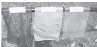
A wide variety of materials can be held in place by “Snap Clamps”.