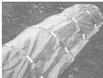
They work great for using clear plastic to make row covers.