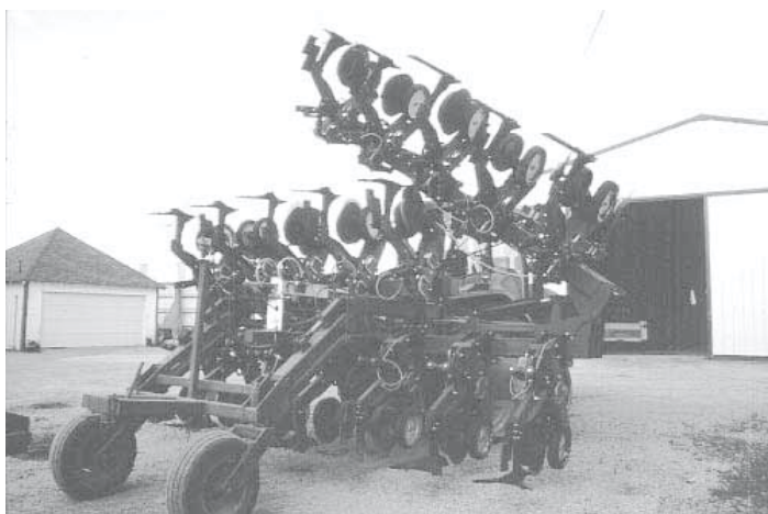
Sixteen-row cultivator toolbar is hinged to fold up five row units on each side and leave six in the middle.

Contact: FARM SHOW Followup, MSI, 8004 California Ave., Fair Oaks, Calif. 95628 (ph 916 961-7378; fax 916 961-7319; E-mail: art@underwaterglue.com; Web site: www.underwaterglue.com).