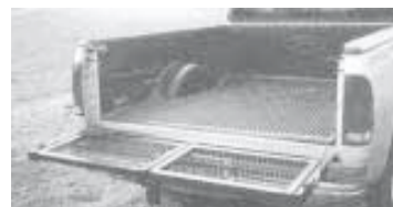
By releasing latch on each side, entire tailgate can be folded down like a conventional tailgate.

size or a fifth wheel model. Both models are designed to fit most full-sized pickup brands and models. "The only limitation is that it won't fit pickups equipped with a flare side box," notes Taplay. "The standard color is black, but we also offer custom colors including silver, gray, red, blue, and yellow."