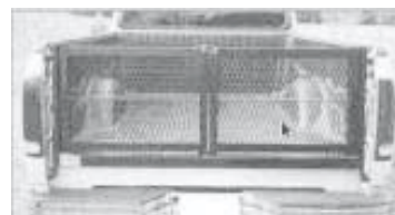
A pair of spring-loaded latches at inside edge of each gate is used to open the two gates, either outward or inward.

Two models are available – a standard full-