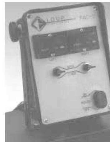
Loup's new fluted seed cup control automatically adjusts the indexed control arm connected to each of the drill's seed cups to change the size of the flute openings.

The company also offers new optical blockage sensors for conventional drills and air seeders that allow you to monitor the seed flow on up to 106 rows at a time. Each sen-