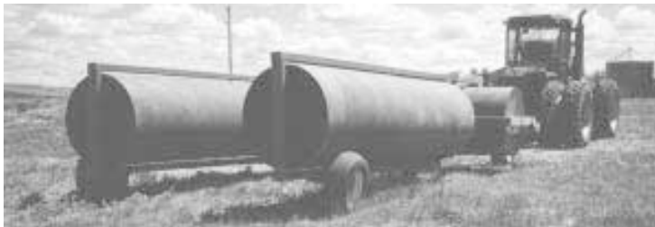
In transport, the frames tilt up on their sides to put the transport wheels on the ground.

Contact: FARM SHOW Followup, Wayne Engel, Creative Manufacturing Inc., Box 88, Woodrow, Sask. S0H 4M0 Canada (ph toll-free 888-458-5765; fax 306 472-5411).