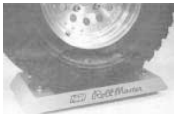
Tire fits in a depression on top of the dolly, which raises the vehicle just 1 in. off the floor.

"You can use the dollies to move everything from cars to dually pickups to light duty dump trucks, and even some motorhomes," says Dauernheim. "A set of four 12-in. wide dollies has a total capacity of 3,000 lbs. while a set of 20-in. wide dollies has a total capacity of 12,000 lbs. They work great for storing antique cars — you can roll a car on a flat floor all by yourself. No matter how small