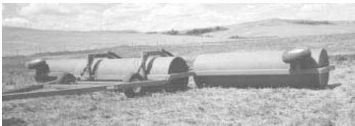
The 48-in. dia. rollers weigh a total of 18,900 lbs. and have a full rolling width of 42 ft.