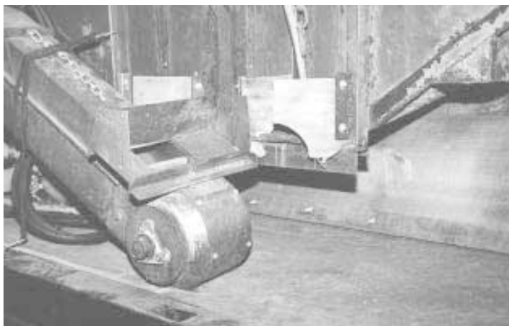
Return elevator is positioned so lower end is just below chute.