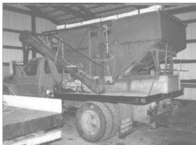
The Ellis's mounted an old gravity box on back of a flatbed, then fitted it with a return elevator off a combine.

We've got a discussion group where you can talk to other FARM SHOW readers . And you can now sign up for free E-mail updates between regular issues of FARM SHOW .