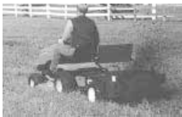
Mill Creek's 6-bu. spreader.

This company offers seven models ranging from 15 to 128 bu. capacity. Overall length ranges from 9 ft. 3 in. to 13 ft. 9 in. They're available with either pto or ground drive. Most models come with a no-rot poly floor that's guaranteed for 20 years. The company says its model 15, at only 6 bu. capacity, is probably the "world's smallest manure spreader". It's designed primarily for people