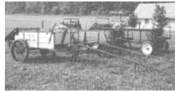
E-Z Spreaders are based on old horse-drawn models from New Idea.

The new models have a rear axle that's a full 1 3/4 in. thick to handle heavy loads. The bearings are larger and grease fittings that