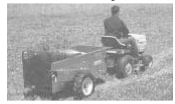
Fuerst spreaders can be ground or pto-driven.

Fuerst manure spreaders are available in ground-driven or pto-powered models and are made from corrosive-resistant steel. Capacities range from 23 to 74 cubic ft. The 23 cu. ft. model is small enough to fit inside a