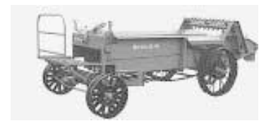
Model 85 horse-drawn spreader has a seat for driver up front. Pequea also offers many other spreader models.

Pequea offers both pto and ground-driven models with capacities ranging from 50 to 110 bu. A conversion kit for horse-drawn use is optional on the smaller models. On models 50 and 70 the beater can be removed so the spreader can be used to haul dirt, sand, compost, leaves, grass clippings, etc. Mod-