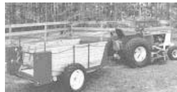
Sideboards on the Country spreader can be removed to use for other hauling jobs.

The company offers two ground-driven models with 25 and 75 bu. capacity. The smaller model is only 46 in. wide and can be pulled by any 10 hp or larger tractor. It weighs just 250 lbs. and has a bed that measures 6 ft. long by 2 1/2 ft. wide by 1 1/2 ft. high. It mounts on high flotation tires. The spreader's drag chain ratchet is driven by one wheel while the rear beater is driven by the other wheel.