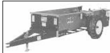
H&S 50-bu. ground-drive spreader is fitted with lugged tires.

Four models with 50, 80, 125, and 175 bu. capacity are available, some ground-driven and others pto-driven. The boxes are constructed of corrosion resistant galvanized steel and have a bonded poly floor that re-