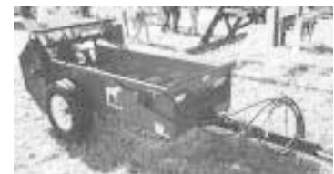
A 15 hp. tractor is all that's needed to pull Tebben's 50 bu. spreader.

Contact: FARM SHOW Followup, Pequea Machine, Inc., 3230 East Gordon Rd., Gordonville, Pa. 17529 (ph 717 768-3197; fax 8380).