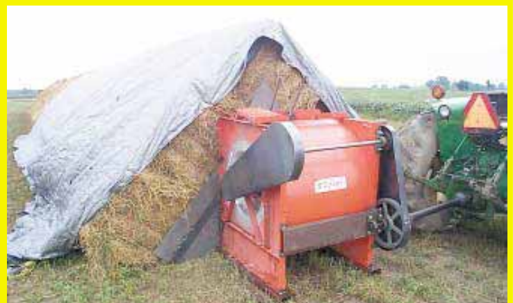
A grain drying fan or silage blower is used to blow air through the tunnel under the bales.

Contact: FARM SHOW Followup, Oscar Frey, Horst Welding, RR3, Listowel, Ontario N4W 3G8 Canada (ph 519 291-4162; fax 519 291-53880; E-mail: sales@horstwelding.com).