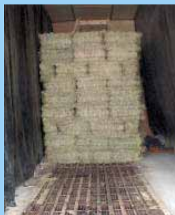
Building houses twin dryers capable of simultaneously drying 800 bales each.

The building houses twin dryers capable of simultaneously drying 800 bales each (a total of 10 160-bale wagon loads). It's also