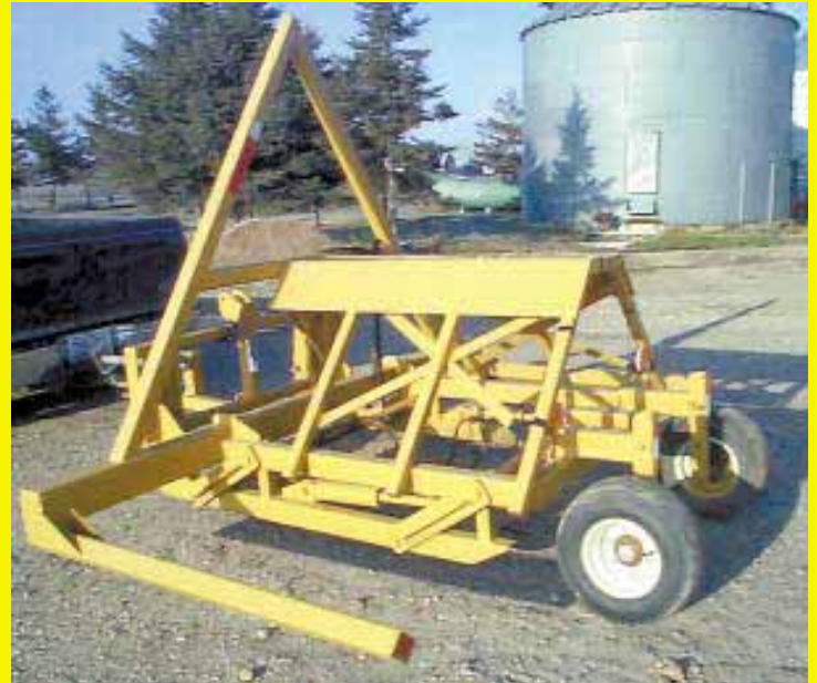
A front-end loader is used to place bales on this "stooker". Side arms lower hydraulically to the ground to unload.