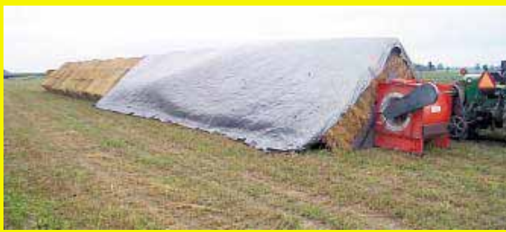
Holborn has successfully dried a line of bales 150 ft. long. Tarp is only needed as protection from rain.