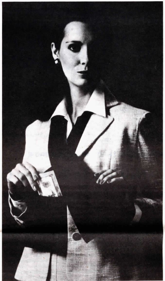
Chic-looking scarf has hidden pocket for money, credit cards, keys and other valuables.