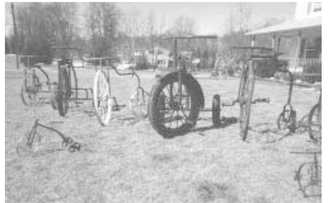
Dennis Baker's bicycles range in size from a 2-ft. high tricycle to a maroon 3-wheeler with handlebars more than 6 ft. high.

Contact: FARM SHOW Followup, Cliff Spence, Elburn, Ill. (ph 708 365-6265 or 9697).