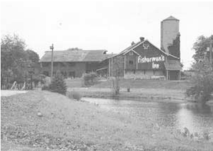
The grounds of the Fisherman's Inn in northern Illinois include 50 acres with 11 ponds, where rainbow trout are raised for the restaurant.

Contact: FARM SHOW Followup, Jim Haenning, 3161 George Road, Okeana, Ohio 45053 (ph 513 738-5659).