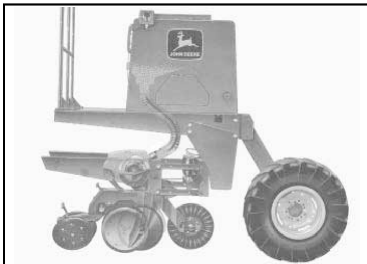
Deere's new 1535 Tru-Vee drill meters seed at the row to provide accurate seed drop and spacing. New plastic, 1/10 th bu. mini hoppers mount above each meter.

Contact: FARM SHOW Followup, Richard Thompson, 2035 190 th St., Boone, Iowa 50036 (ph 515432-1560).