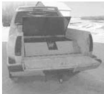
Toolbox has a gas shock assisted, easy-open lid. Back part of toolbox slopes down to pickup bed floor.