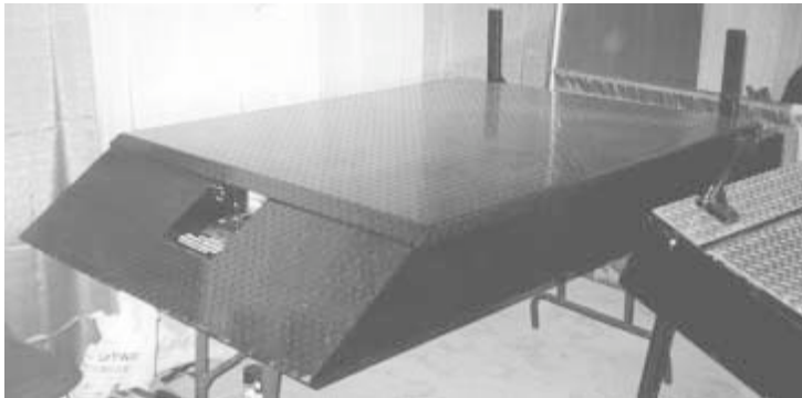
Toolbox is made from either chrome or diamond plate steel. You can drive ATV right on top of toolbox.

Contact: FARM SHOW Followup, ETEC, 2310 Hanselman Ave., Saskatoon, Sask., Canada S7L 5Z3 (ph 800 434-5309; Website: www.loadpro.ca).