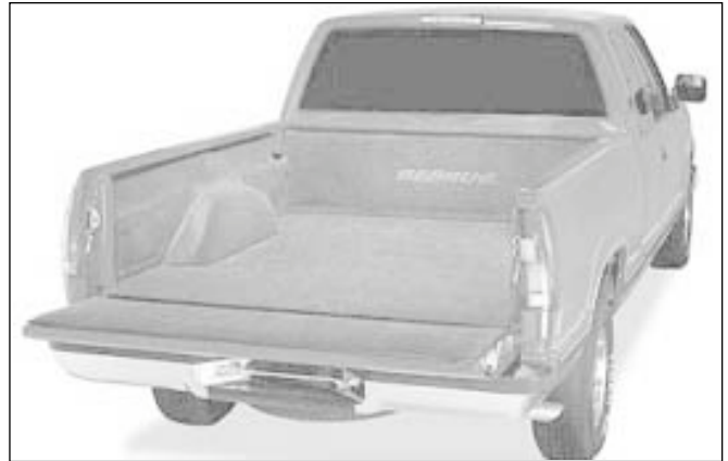
One-piece, custom molded mat is designed to cover pickup's floor and side walls.

Contact: FARM SHOW Followup, Rapid Ramp, Box 217, Harvard, Neb. 68944 (ph 402 772-3501).