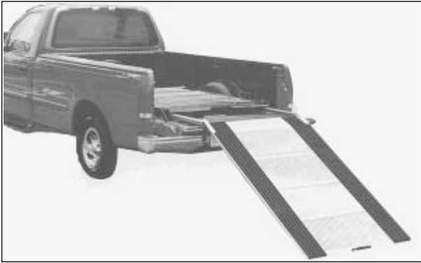
Load Pro covers existing pickup bed with a false floor. Loading platform and telescoping extensions store beneath the cargo deck.