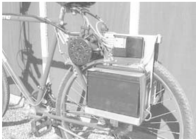
Kit includes a motor and two 12-volt batteries, as well as a 24 to 12-volt power converter that lets you operate 12-volt accessories, such as lights and horn.