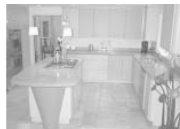
Using special formulations and colorings, concrete fabricators can make countertops in any number of kitchen or bathroom colors.

If you were doing it yourself, you'd probably pour a concrete countertop in place, but the experts say making countertops is not a trick you should try at home. Rather, it should be done in a fabricating shop where lines and edges can be formed more precisely and it can be cured and sealed under controlled conditions.