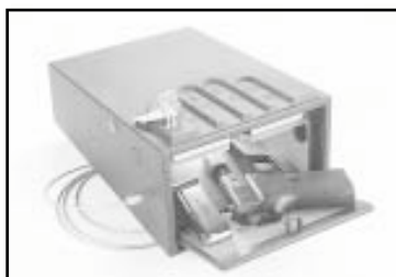
Owners can get quick access to their gun using an electronic keypad. The spring-loaded door pops open when the correct code is entered.

Sells for $130. A 2-gun vault is available. Contact: FARM SHOW Followup, GunGuard GunVault, Doskocil Manufactur-