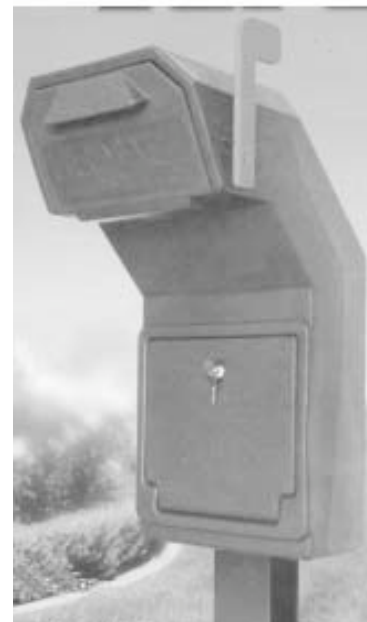
Mailbox has 2 compartments - a non-lockable one at top for outgoing mail and a lockable one at bottom for incoming mail.

Contact: FARM SHOW Followup, MailGuard, Division of Neogenesis, Inc., 1146 S. Linden Road, Flint, Mich. 48532 (ph 810 720-6245; fax 810 733-1533; E-mail: info@mailguard.net; Website: www.MailGuard.net).