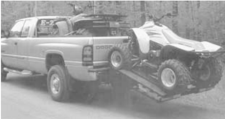
Rear-mounted ramp system fits into pickup receiver hitch. No need to remove tailgate.

Contact: FARM SHOW Followup, Wisconsin Metal Fab, 1875 Olson drive, Box 27, Chippewa Falls, Wis. 54729 (ph 715 720-1794; fax 715 720-1797; Website: www.wisconsinmetalfab.com).