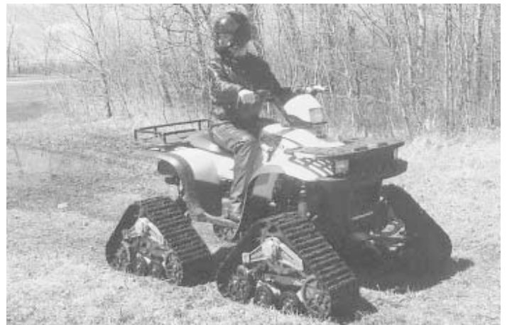
ATV conversion tracks provide about 4 in. of extra clearance, yet actually lower the center of gravity, making your ATV more stable.

All prices include shipping. Add $.50 per issue in Canada. Contact: FARM SHOW Back Issues, P.O. Box 1029, Lakeville, Minn. 55044 ph toll-free 800-834-9665 or 952 469-5572 M-F, 7:30 to 4:30 M-F CST)