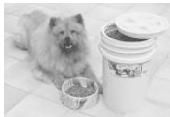
Buckets fitted with spin-on lid make great airtight containers for pet food.

Contact: FARM SHOW Followup, Gamma Plastics 2000, San Diego, Calif. (ph 800 842-6543; E-mail: gamma@fda.net; Website: www.gammoplastics.com).