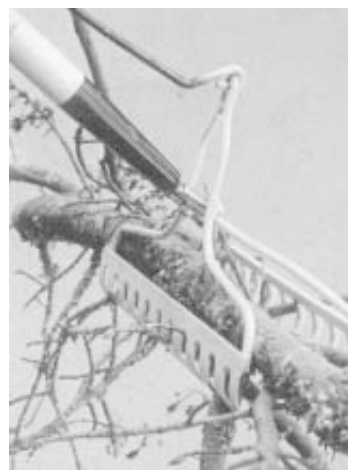
Second rake head pivots downward to pick up sticks, leaves and other debris.

Contact: FARM SHOW Followup, Rake-Up, 12701 Wagner Road, Monroe, Wash. 98272 (ph toll-free 877 772-5387 or 425 823-0800; fax 425 820-5631).