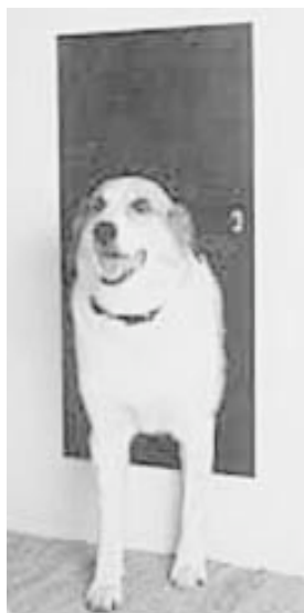
Remote-controlled door only opens for dog or cat wearing sensor.

Contact: FARM SHOW Followup, Henry Solo (ph 877 766-3900; Website: www.solopetdoors.com).