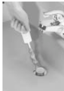
Zip-It is a 20-in. long plastic strip with barbs on either side. You stick it down into the drain and pull it back out to clean plug-ups.