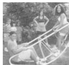
Riders stay parallel to ground when riding the new “sports rocker”.

The rocker is 8 ft. long, 3 ft. high at the middle, and rounded at the bottom. It consists of a pair of half moon-shaped aluminum frames spaced about 2 ft. apart. Wooden seats near each end are suspended from the frame by lengths of chain link. The child hangs onto a foam-protected handlebar and