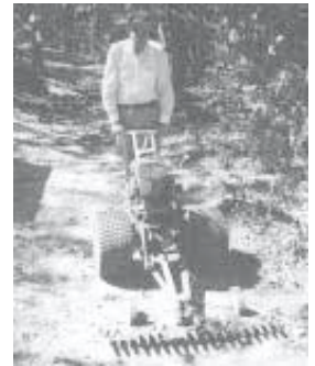
“Big wheels make my walk-behind mower easy to push,” says Self.

The four-wheeled mower carries the 3-ft. wide sickle blade on front. The 18-in. high rear wheels and axle came off a 10 hp Sears riding mower. Power is supplied by a 2 hp Briggs & Stratton gas engine. The engine chain-drives a gearbox that’s connected to a long wooden arm, which operates a pitman that drives the sickle blades back and forth. The rig is equipped with two belt-driven manual transmissions, both off Sears riding mowers. The main transmission mounts on a steel frame behind the rear wheels, while