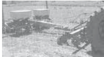
Planter is pulled by a drawbar that attaches to 3-pt. mounted toolbar

“It lets me plant in about one fourth the time, saving on fuel and labor,” says Souslin. “I use it mainly to plant corn but I think the idea could be used to plant any row crop. I