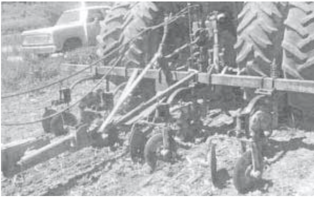
“Row tiller” chisel plows and disks just ahead of Souslin’s Deere planter.