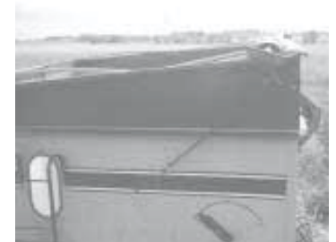
Reifschneider fastened a tarp to one side of hopper on his grain cart and rolls tarp up onto a piece of pipe.

Contact: FARM SHOW Followup, Randy Reifschneider, 10293 609th Ave., Hubbard, Iowa 50122 (ph 515 487-7503).