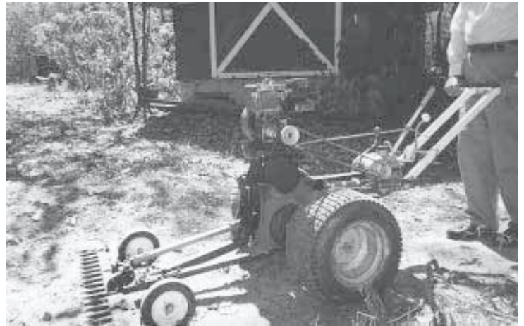
A 3-ft. wide sickle blade on front of 4-wheeled mower. Rear wheels and axle came off a 10 hp Sears riding mower.

Contact: FARM SHOW Followup, Francis Grabinski, 36247 170 th St., Rockham, S. Dak. 57470.