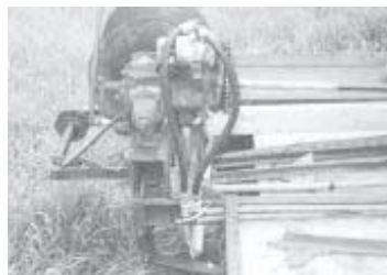
A hydraulic motor chain-drives gearbox.

“I can roll up to 1/2 mile of wire per spool.