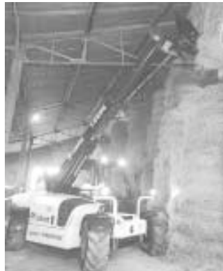
Bobcat's first-ever telehandler can lift up to 3 tons.

Contact: FARM SHOW Followup, Bobcat Information Center, London House, 271 King St., Hammersmith, London, England W6 9LZ (ph 011 44 181 20 8748-8900; fax 011 44 181 20 8741-9508).