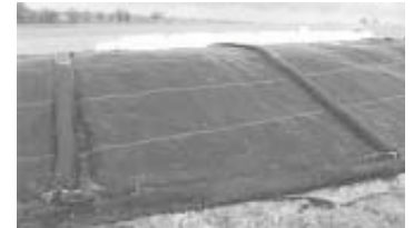
After covering silage with plastic as usual you lay a woven protective tarp over the top. Then you load the tarp with rows of tubes filled with 5-ft. long sand bags.

Contact: FARM SHOW Followup, Velitex, 19, Rue du Pont Colbert, 78000 Versailles, France (ph 011 33 139-022121; fax 011 33 139-532291; E-mail: velitex@agrotexile.com).