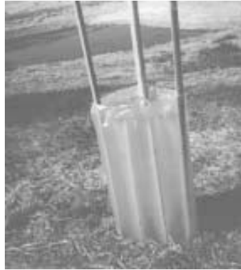
The WaterTube holds about 5 gal. of water and drips it slowly out the bottom. 4117). (Excerpted from Power Farming Magazine)

Contact: FARM SHOW Followup, Christopher Ball, Mildura Native Nursery, Mildura, NSW, Australia (ph 011 61 03 5021