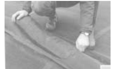
After filling bags with sand you slide them inside one end of tube, then close ends of tube using attached strings.