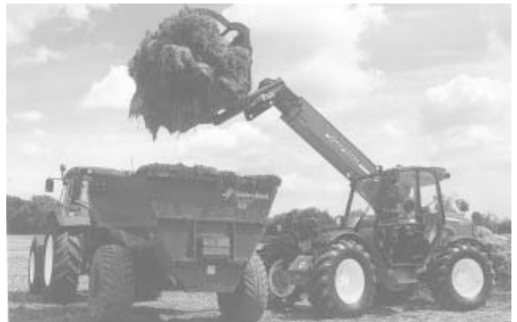
Deere recently bought Matbro and totally re-engineered the company's telehandler.

Contact: FARM SHOW Followup, C-DAX, Tri-Ag Ltd., Wymondham, Norfolk, England NR18 9LR (ph 011 44 1953-605151; fax 011 44 1953-607818; E-mail: howard@tri-ag-uk.com; Website: www.tri-ag-ltd.co.uk).