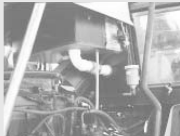
Air is pulled from cab by a 2-in. dia. plastic pipe.