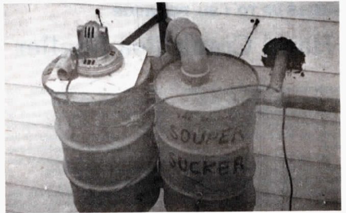
Sizer's cleaner consists of two 25 gal. drums, plastic pipe, and an insulation blower.

For more details, contact: FARM SHOW Followup, Altoll Mfg., Star Rt. 36, Box 84B, Havre, Mont. 59501 (ph 406 265-8349).