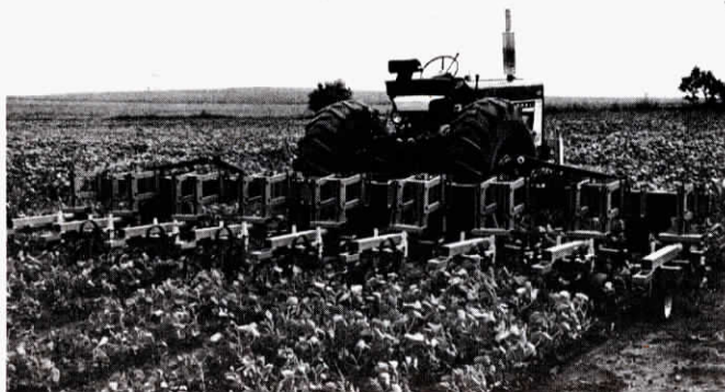
The "Space Setter" switches from 30-in. corn rows to 15-in. soybean rows in minutes and can be adjusted to leave skip rows for the tractor tires.

"There are five S-tines on each gang. In corn rows, there is one gang between every row. To switch to narrow rows, you just unbolt and remove the rear tine, which takes just a couple minutes. The gauge wheels slide in or out on each gang, depending on the size and state of the crop."