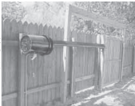
Garage door opener mounts on back side of fence. The 6-ft. wide wooden gate slides back and forth on standard sliding door hardware.