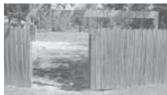
Gate mounts on a 12-ft. long frame made out of treated 4 by 6's.

"It works great and cost very little to set