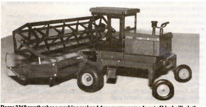
Deere 2360 swather has a working reel and draper canvas made out of black silk cloth.

Janzen has also built a 12-row sugar beet planter, a 4440 tractor equipped with a 3-pt. hitch and an adjustable front axle, a 4620 tractor, an air seeder, and rock pickers.