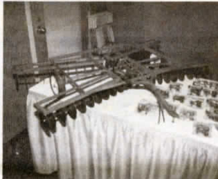
This tandem disk has hydraulic hoses.