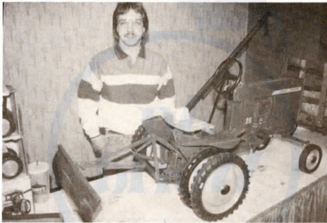
Smith's 3-pt. scraper blade mounts on a removeable 3-pt. hitch and can be raised or lowered by moving a lever up or down. Note wagon and grain auger in background.