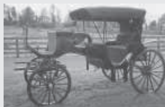
Carriage from Wegler Carriages, Odon, Ind.

White Mud River Carriage and Wagon Works Box 98 Climax, Sask. SON ONO ph 306 293-2031 Website: www.3.telus.net/whitemudcarriage/