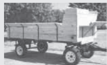
Wagon built by Shiloh Wagon Works.