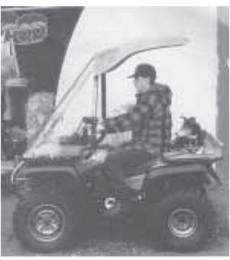
Hardtop ATV cab has gutters that keep rain from running over the side onto driver.

The hard-top sells for $1,175 and the softtop comes complete with a backdrop for