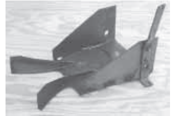
Baffle is easy to attach whenever it's needed.