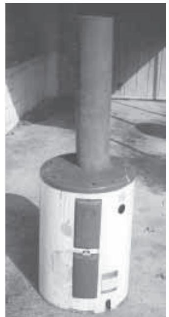
Burner made from water heater eliminates stumps quietly.