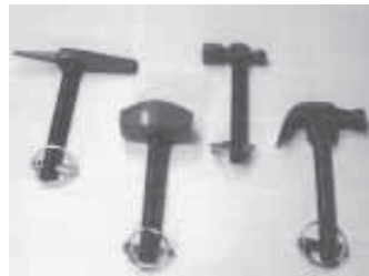
Huntley makes all kinds of hitch pin hammers.

"The 5/8-in. dia. rod is the same size as a