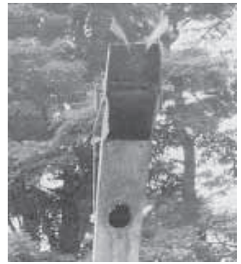
Curved baffles spread spoiled hay out evenly on the field.

Contact: FARM SHOW Followup, William E. Olin, 336 County Road 26, Nineveh, N.Y. 13813 (ph 607 693-2854).