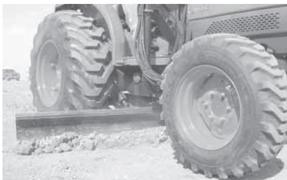
Blade quick-tach to frame of 38 to 55 hp utility tractors.

Contact: FARM SHOW Followup, Pat McGee, 3213 Bayou Mallet Rd., Eunice, La. 70535 (ph 337 457-4901).