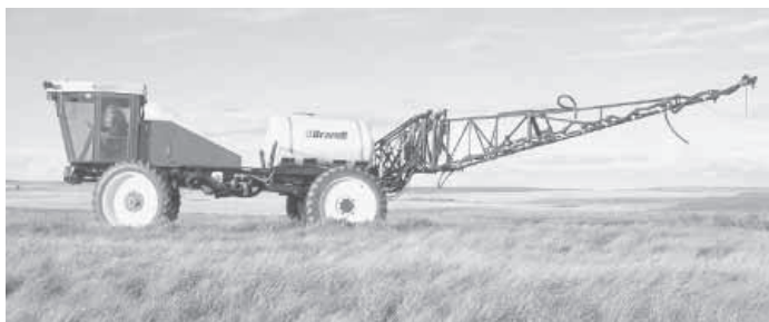
To build sprayer, Shaune Switzer moved engine and transmission back on school bus frame and added a combine cab.