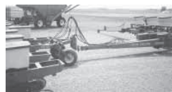
Tongue on rear planter hooks up to back of splitter hitch without modification.

"I've used this planter arrangement for six years and really like the job it does," says Smidt. "At the time I built it a new drill of comparable size would have cost $25,000 to $30,000. Great Plains made a 3-pt. mounted 5-row narrow planter with a hitch for use with a 6-row narrow pull-type planter, but nothing for an 8-row wide planter like I had. I