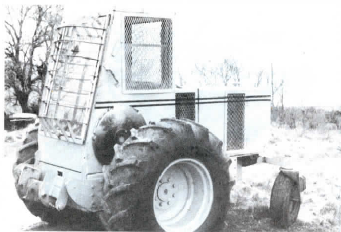
The Scat Tractor maneuvers like a skid steer loader but has more powerful hydraulics and can go places skid steers can't go because of its large tractor-size wheels.