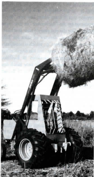
In addition to clearing land, the Scat Tractor can be fitted with a front-end loader.

The front 3-pt. hitch, specially designed for the tractor, can be equipped with a 29-in. dia. tree-cutting blade that mounts on a 6-ft.