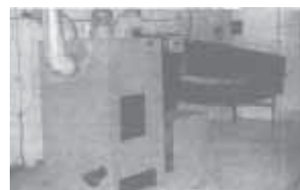
Chain-driven conveyor attaches to stove. When the spring-loaded grill lifts up, triggering conveyor, wood burns down.

When the switch on the grate shaft signals for more wood, the cog turns, opening the door. The conveyor dumps the load from the first section onto the grate. As the cog continues to turn, it closes the stove door and the weight of the wood on the grate shuts off the switch.