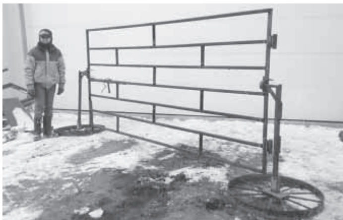
Roy Klindt builds gates out of steel tubing. His homemade "swivel stand" allows him to quickly turn the gate over without having to do any lifting.