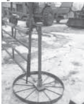
A pair of rake wheels serve as stands, with a 3 1/2-ft. high vertical steel pipe mounted to each wheel hub.