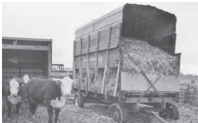
Viel mounted an old forage wagon box on a wagon running gear to convert it into a feed wagon. He uses a green feed chopper in the field to fill the wagon with corn stalks.

Contact: FARM SHOW Followup, James Finch, Jimmy Finch Welding, 2787 Lower Meeker Hollow, Roxbury, N.Y. 12474 (ph 607 326-7529).