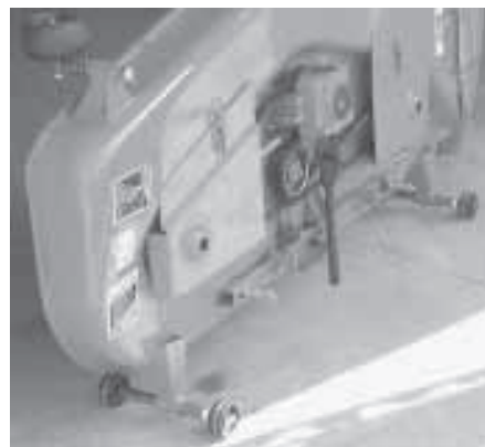
Axles pin on in place of a pair of anti-scalping wheels on back of deck.

Contact: FARM SHOW Followup, Lubbock Gasket & Supply, 402 19th Street, Lubbock, Texas 79401 (ph 800 527-2064; fax 806 763-0965; email: lgasket@swbell.net; website: www.lubbockgasket.com).