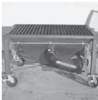
Portable downdraft cutting table is equipped with its own fan exhaust. Smoke is pulled down through table, then piped to fans on one side of table.

"I was surprised at how well it works, especially because I had never seen a downdraft system like this before," says Noth. "It works much better than a hood system and is also