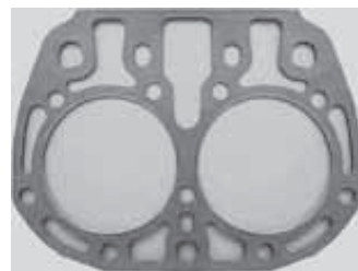
Lubbock Gasket stocks head gaskets for many older engines and maintains a supply of other higher demand gaskets for older farm equipment.

"We do a lot of work with engine rebuilders who re-bore cylinders and need head gaskets that are no longer stock," he says. "We also work with tractor pullers who modify their engines. We keep a file on these, so if someone needs a replacement for one of our custom gaskets, we can make it up quickly. Or if they bought a pulling tractor or modified engine from someone we've dealt with, they can call us with just the information on where they got the engine and