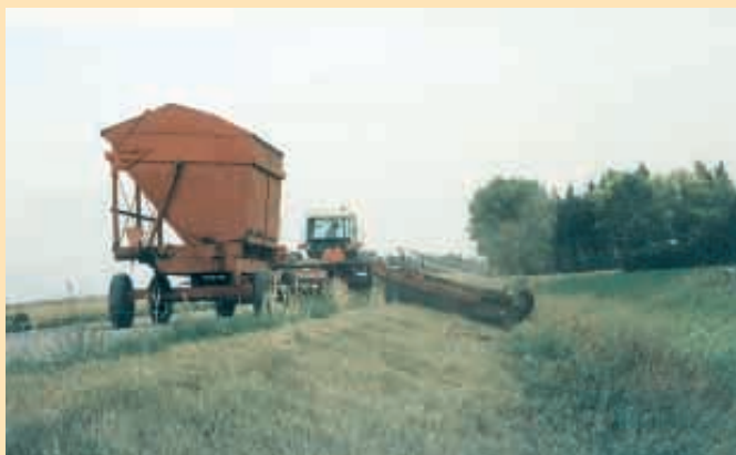
Forage harvester on the road chops and blows material into a high dump wagon.

swather. It supplies pressure to all the hydraulics except the cylinder for the header arm. That is run directly off the tractor's hydraulic system. Running everything off hydraulic orbital motors made set-up much easier than belts and pulleys.