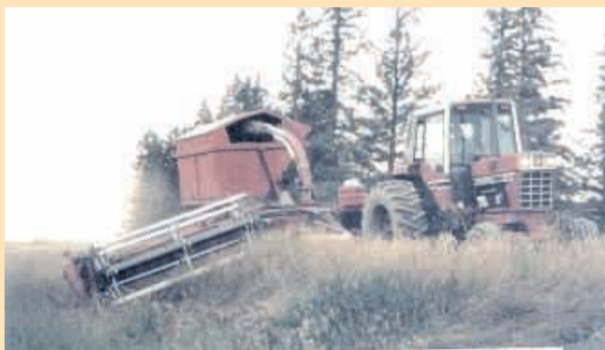
With his home-built ditch swather, Heimer is able to stay on the road while cutting grass in ditches. He chops it and hauls it home.

To power the forage harvester, Reimer ran a 15-ft. pto shaft across the ditch swather frame. Along the way, a belt pulley mounted on the shaft powers a hydraulic pump on the