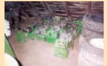
These photos show some of the different kinds of parts available including mower decks, fuel tanks, tires and other items.