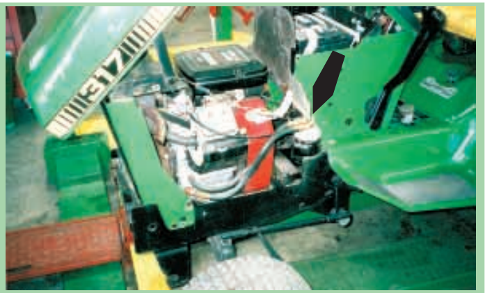
Deere 317 tractor originally had a Kohler 17 hp engine, which Kaczmarek replaced with a Vanguard 20 hp model. Note external oil filter relocation kit (arrow).