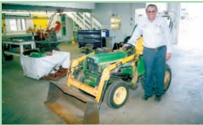
This 1973 Deere Hydro 140 equipped with a front-end loader was originally equipped with a Kohler 14 hp engine. Kaczmarek replaced it with a 14 hp Vanguard.