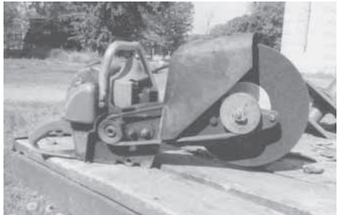
Vern Desotell mounted a 14-in. dia. chop saw blade onto the bar of an old chain saw to make this low-cost steel chop saw.

Contact: FARM SHOW Followup, Gary Goldsberry, 925 W. 9 th Ave., Stillwater, Okla. 74074 (ph 405 372-1612; email: garygoldsberry@yahoo.com).