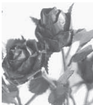
Making roses from metal is a 600-year-old tradition.

The first rose he ever made took him 4 1/2 hours, but now he can do one in anywhere from 15 to 35 minutes. These roses measure 1 1/2 to 2 in. across, and he sells them for $35 each.