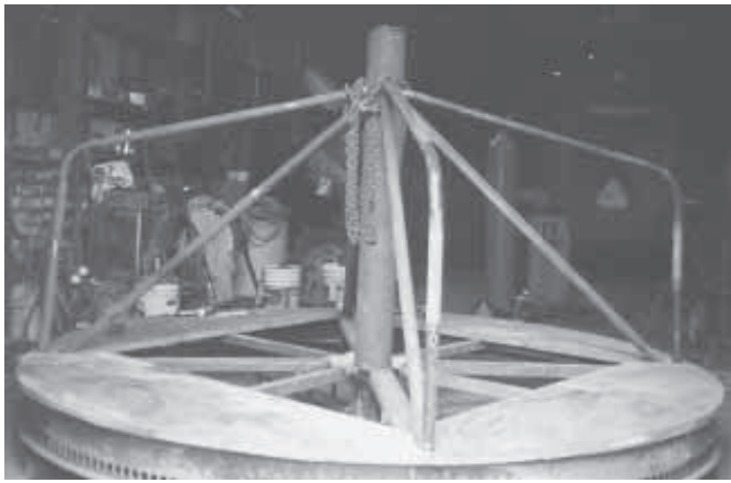
Silo unloader was turned into ride using 2-in. steel tubing, plywood and a silo unloader. It took about 20 to 25 hours to build.