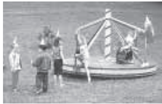
Over 20 children used the ride at once at a recent party.

"I painted it Deere green and yellow with the center pipe swirled like a barber's pole," he says. "It looks kind of neat when it's turning. I had 20 to 30 kids here for a birthday party one time and all of them were on there