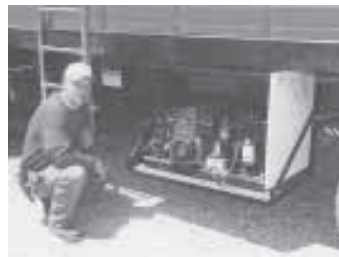
Shelf under bed of truck holds gas engine and blower.