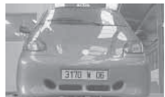
Car is powered by compressed air stored in two steel-reinforced thermoplastic air tanks that attach to car's undercarriage.

Contact: FARM SHOW Followup, Tom Heimbuch, 122nd Ave S.E., Cogswell, N. Dak. 58017 (ph 701 724-3785).