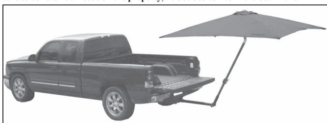
Umbrella mounts on a 6-ft. long aluminum pole that fits into 2-in. receiver hitches.