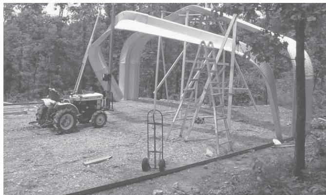
Rose put up this 30 by 40-ft. building which consists of overlapping metal spans.

Contact: FARM SHOW Followup, Lester Rose, 2136 MC 8050, Yellville, Arkansas. 72687 (ph 870 449-2125; lester_rose@hotmail.com) or U.S. Building Direct (ph 800 463-6062; www.usbuildingsdirect.com).