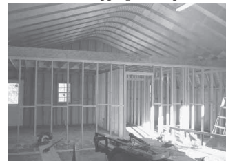
He intended to use the building only as a shop, but after learning how long it would take to build a new house on the property, he decided to live in the back 16 ft.