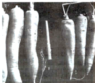
In controlled tests at the University of Nebraska, aerated carrots (left) grew an average of 11 in. Non-aerated carrots averaged 7.5 in.

"The system has also been used on popcorn, field corn, sweet corn, vegetable crops, triticale test plots, nursery trees, etc. So far we've installed over a million feet of the specially-designed tubing in Iowa, Nebraska, Colorado, Oregon, and Idaho. We started out doing small 20 and 50-acre plots, but the projects keep getting bigger. This fall we installed a system on 40 acres of potatoes. We can even install the system on fields irrigated by center pivots. Air moves farther in the soil than water does so much less tubing is needed, greatly reducing the cost. We use special-designed subsurface irrigation tubing that works well for both