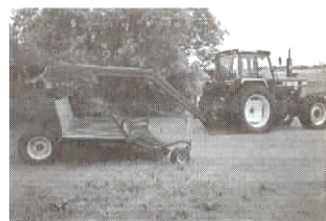
Swath turner features a 16-ft. wide pickup and center pivot gooseneck hitch.

The pickup uses three 4-in. dia. rollers to gather hay. Belts, made out of standard pickup canvas laced together in a 16-ft.