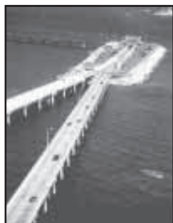
Photo shows one point where the Chesapeake Bay Bridge heads underwater to allow ships to pass.

I heard from 50 or so faithful readers about last issue's story on the "world's first" underwater bridge in Scandinavia. Turns out there's a very similar bridge in the U.S. – and it's been in operation since 1964!