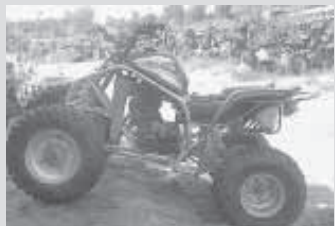
Steve's Cycle specializes in used and new parts for all ATV's.

Steve's buys wrecked, burned or non-working machines from individuals, insurance companies and even dealers who take in older used machines on trade that they