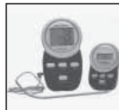
BBQ thermometer pages you when your meal is cooked.

Contact: FARM SHOW Followup, Klockit, P.O. Box 636 N3211 County Road H, Lake Geneva, Wis. 53147 (ph 800 556-2548; email: klockit@klockit.com; website: www.klockit.com).