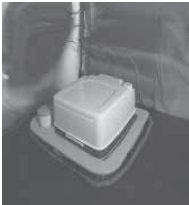
Indipod portable toilet comes with a "privacy bubble" that's blown up by a 12-volt fan.

Contact: FARM SHOW Followup, DayCar Ltd., 71 A High Street, Bromsgrove, Worcestershire, United Kingdom B61 8AQ (ph 44 (0) 1527 577758; email: enquiries@indipod.com; website: www.indipod.com).