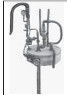
Solar heat unit is inserted into existing water heater.