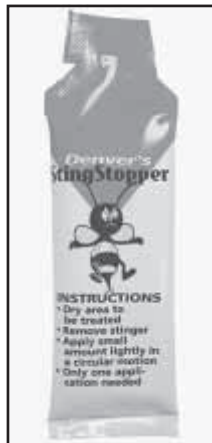
Denver's Sting Stopper stops bee sting pain.