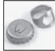
Ring Thing fits on your finger to quickly pop off bottle caps.

Sells for $9.99 plus S&H. Contact: FARM SHOW Followup, Mango International, Inc. P.O. Box 478, Pine Island, N.Y. 10969 (ph 877 886-2646 or 845 258-9903; email: info@mangointernational.biz; website: www.mangointernational.biz).