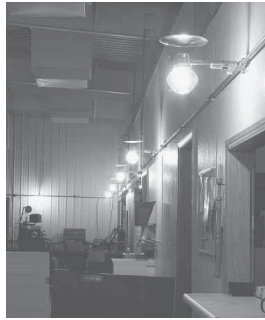
Propane-fueled lamps produce light that rivals a 100-watt bulb.

Contact: FARM SHOW Followup, Midstate Lamp Co., 169 E. CR 200N, Arthur, Ill. 61911 (ph 217 543-3065; toll free 866 450-5267).