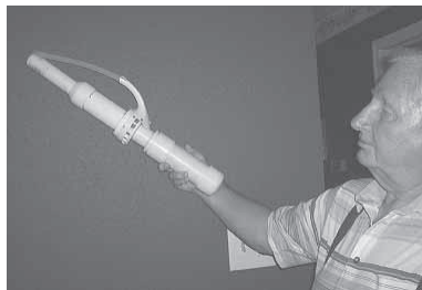
Device stuns flies and then sucks them right out of the air.

Contact: FARM SHOW Followup, Don Septer, 18158 Bracken Circle, Port Charlotte, Fla. 33948 (ph 941 743-7650; dsepter@webtv.net; www.inventionconnection.com/booths/booth412).