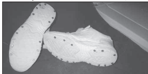
No. 7 hex head sheet metal screws are screwed around edge of tennis shoe.