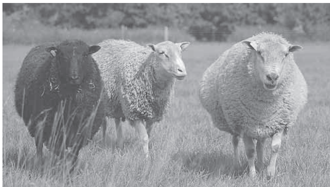
The Finnsheep is a rare, multi-purpose sheep breed. They have become popular with hand spinners for their lustrous, soft and lightweight fiber.