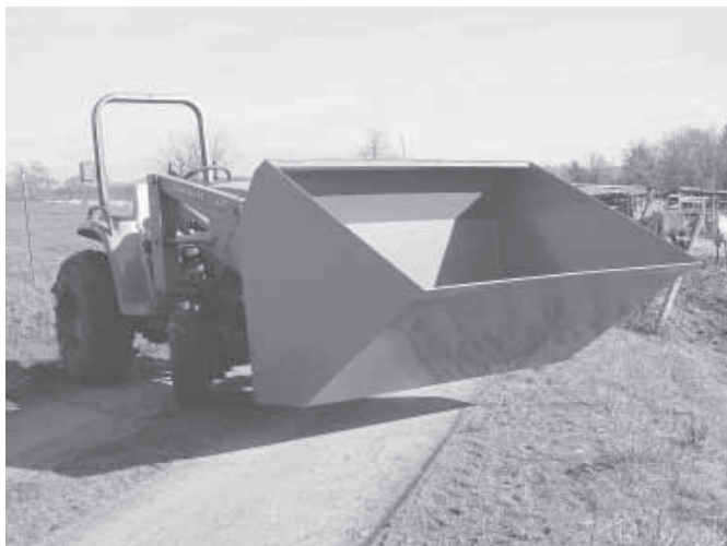
Oversized loader bucket has about four times more volume than a conventional bucket.

Contact: FARM SHOW Followup, Roger Smith, Aerlanden Load Implements Company, 25136 Mount Richmond Rd., Yamhill, Ore. 97148 (ph 503 662-3067; fax 503 662-4160; toolmaster@aerlanden.com; www.aerlanden.com).