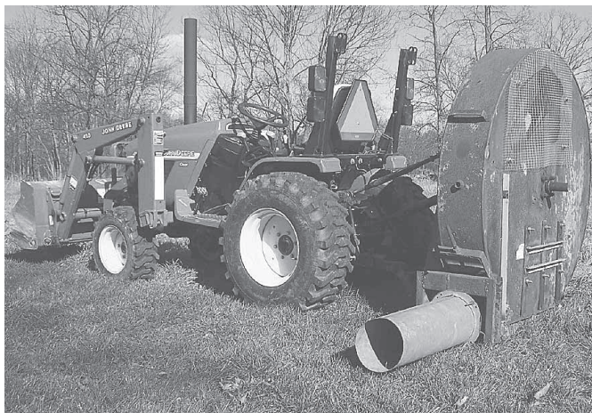
Hensley used a 15-year-old Ford 618 silage blower to make the bigger leaf blower. "I use a Deere 4110 20 hp tractor to power it on the 3-pt. hitch."

Contact: FARM SHOW Followup, Rick Hensley, 78 Kurpick Rd., Port Jervis, N.Y. 12771 (ph 845 856-1508; hotrodland@frontiernet.net).