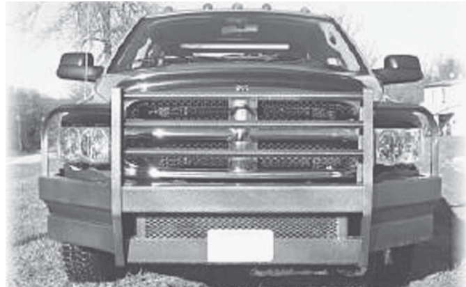
Bumper weighs 200 lbs. and covers the entire grill area. Miller has models that fit most pickup models. They sell for $1,050 plus S&H.