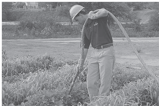
Plant roots pull gold and other precious metals out of mining waste that would otherwise be too costly to process.

Contact: FARM SHOW Followup, John W. Capps, 543 Fleshood Lane, Lawrenceville, Va. 23868 (ph 434 848-4274).