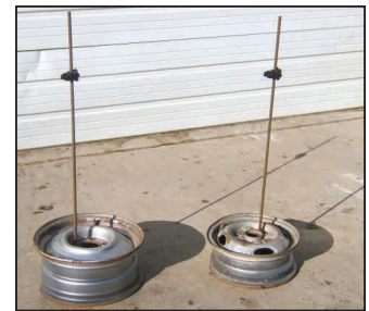
Temporary fence posts were made by welding 3 1/2-ft. sections of 3/8-in. rebar to junked car rims.

McCoy grazes 300-plus cows using this system with about 65 of these portable posts.