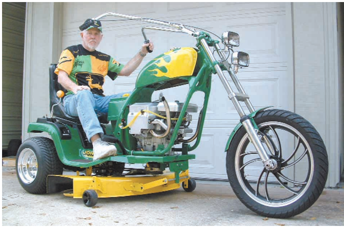
C.G. Mouch built this 3-wheeled "easy rider chopper mower" equipped with a 38-in. belly-mount deck. It's powered by a horizontally opposed 18 hp Briggs & Stratton gas engine.