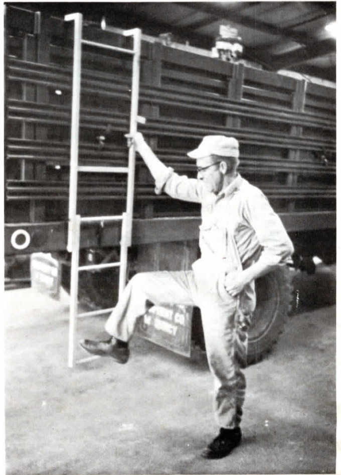
Safe-T ladder can be used on sides or back of the truck. Bottom section folds up when not in use.

For more information on either or both products, contact: FARM SHOW Followup, Turner Mfg., Thompson, Mo. 65285 (ph. 314 682-3813).