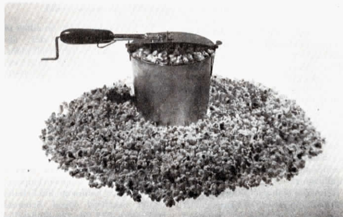
Brinkman Popal Popper features built-in stirring device.

For more details, contact: FARM SHOW Followup, Brinkman Popal Popper, 4544 Wanamaker Road, Route 9, Topeka, Kan. 66604 (ph 913 478-4643).