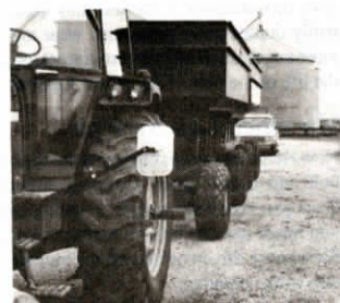
Mirror mounts on right or left side.

Contact: FARM SHOW Followup, Pierce Mfg., Rt. 1, Box 110, Sullivan, Ill. 61951 (ph 217 752-6728, or 6727).