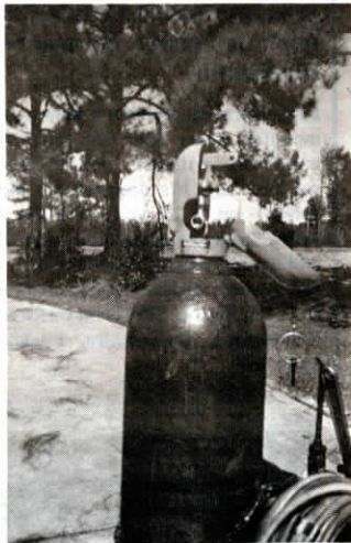
Hinging cap splits apart in center by pulling a single pin.

For more information, contact: FARM SHOW Followup, B.C. Griffin, Griffin, Inc., P.O. Box 760, Pamplico, S.C. 29583 (ph 803 493-5760).