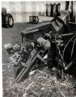
Hydra-Axe will cross-cut through wood up to about 10 in. in dia.

For more information, contact: FARM SHOW Followup, Nay's Service, 3482 Columbia Ave., Corning, Calif. 96021 (ph 916 824-5822).