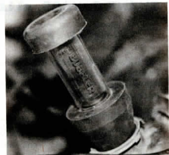
Bubbler is filled with tap water and held in radiator opening for 5 min. while engine is cold.

"When a leak develops between the engine block, head or head gasket and the water jacket, the pressure built up in the combustion chamber is many times the normal 14 psi pressure under which most cooling systems operate and air bubbles will be created in the radiator," the manufacturer points out. "The Bubbler makes it