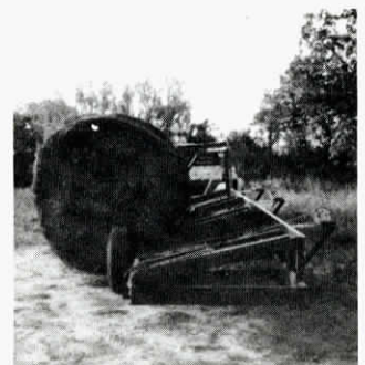
Hand winches crank each bale onto new bale wagon.

For more information, contact: FARM SHOW Followup, Jones Trailer Co., P.O. 242, Woodson, Tex. 76901 (ph 817 345-6759).