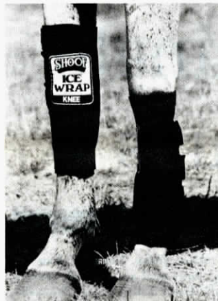
New leg wrap contains a liquid that can be chilled or heated.

The Ice Wrap comes in four different sizes for specific area use — wraps for shins, tendons, knees and hocks are all available in both left and