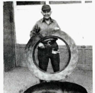
Works like a glorified can opener, says inventor.

winch. To unload, the stakes are removed and the bale lowered slowly to the ground.