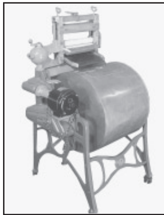
Albaugh-Dover Co., Chicago, Ill., 1920