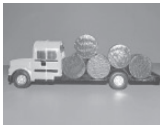
Other schoolbus conversion toys include this flatbed bale hauler (above) and a livestock hauler.

He starts with 1/64-scale Ertl toy buses that have a metal frame and a plastic body. He unscrews the body and then uses a bandsaw to cut pieces apart before gluing them back together.