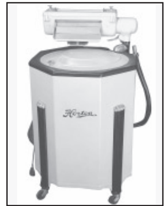
Horton Mfg. Co., Fort Wayne, Ind., 1940