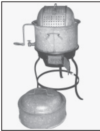
Krauss Werke, Germany 1904