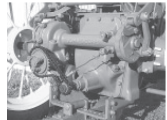
Power lift system is designed to raise and lower a cultivator or a two-way plow and operates independently of the loader. It makes use of two mechanical clutches.