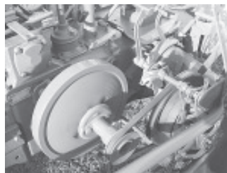
From the flywheel, a belt-driven clutch brake operates a windlass that mounts under tractor’s rear axle. It winds the cables to lift or lower the loader.