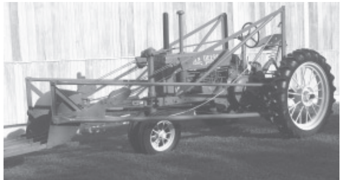
Owned by Dave Badger of Polk, Ohio, this 1937 Deere “B” tractor is equipped with a model 25 “cable lift loader”. It was Deere’s first version of a front-end loader.

Contact: FARM SHOW Followup, Dave Badger, 285 State Route 604, Polk, Ohio 44866 (ph 419 869-9022; greenbarn285@cs.com).