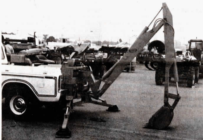
A tractor-mounted backhoe is also available from Bradco.