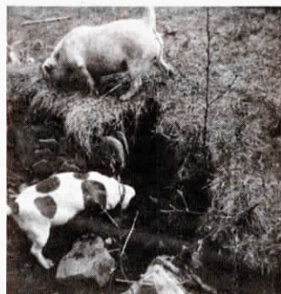
Bred to kill rodents, the dogs are patient hunters.

For more details, contact: FARM SHOW Followup, Ken James, RD 3, Box 272A, Bedford, Pa. 15522 (ph 814 356-3106).