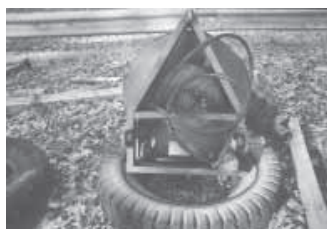
Hydraulic motor is used to chain-drive the unroller.

"Originally I tried a third spear, but it held too much hay, so I cut it off," notes Golden.