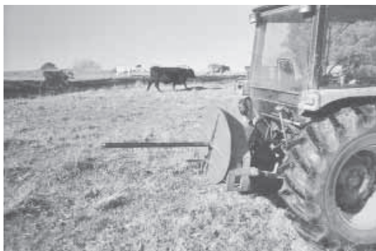
Charlie Golden built this hydraulic-operated unroller. He'd rather unroll bales on the ground than put them in bale rings.

Contact: FARM SHOW Followup, LeRoy Lyne, 2750 Wilderness Road, Clay Center, Kansas 67432 (ph 785 427-2423).