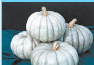
Jarrahdale - Decorative, slate-gray, ribbed fruits with heavy, rounded ribs.