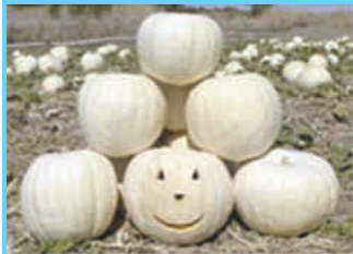
Full Moon - The "Great White" of pumpkins.

Contact: FARM SHOW Followup, Johnny's Selected Seeds, 955 Benton Avenue, Winslow, Maine 04901 (ph 877 564-6697, business line 207 861-3900; catalog store 207 861-3999; fax (U.S. only) 800 738-6314, (non-U.S.): 207 861-8363), or Double Rabbit Farm, 27211 Co. Hwy. 4, Lamberton, Minn. 56152 (ph 507 752-6008).