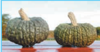
Marina Di Chioggia - Has a blistery, bubbled, slate blue-green rind.