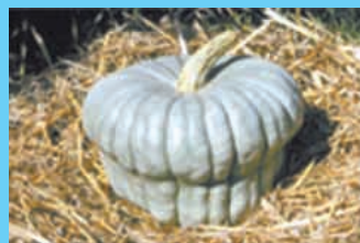
Queensland Blue - Has bluish-green, buttercup-shaped fruits with deep ribbing.