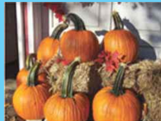
Wolf - Round pumpkins with very thick, long, strong handles.