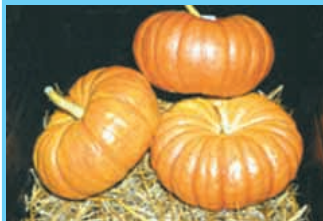
Rouge vif D'Etampes - Flat-looking fruit resembles a red cheese wheel.